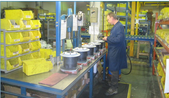
Maintain the overall ambient lighting levels at 500 lux, as specified in Table 4-1 in section 4.65 of the Occupational Health and Safety Regulation.

The risk can be minimized by improving lighting and visibility, as in the following examples.